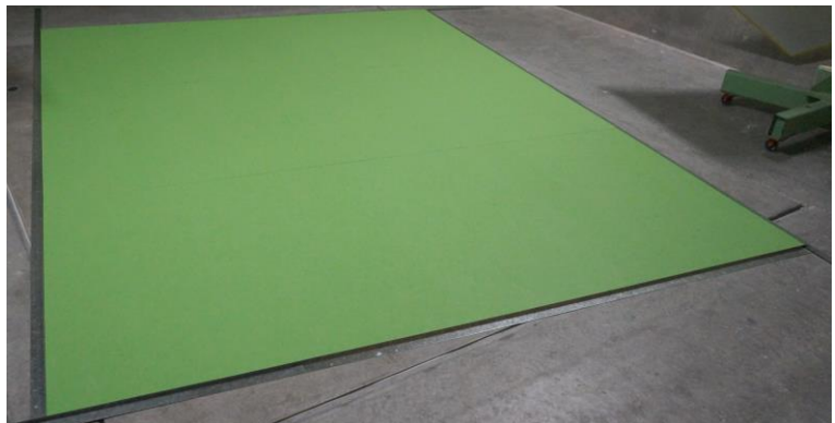
Test specimen installed for testing